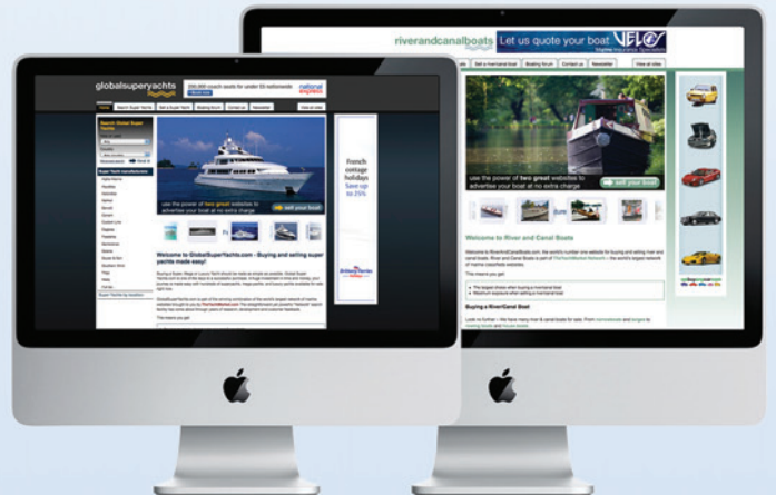
Global Super Yachts www.globalsuperyachts.com River and Canal Boats www.riverandcanalboats.com