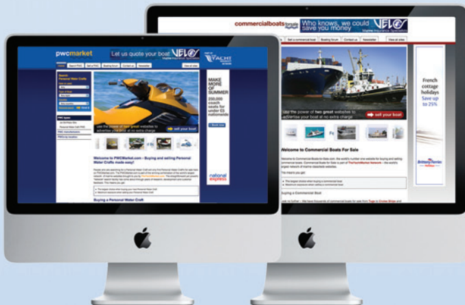
PWC Market www.pwcmarket.com Commercial Boats for Sale www.commercial-boats-for-sale.com