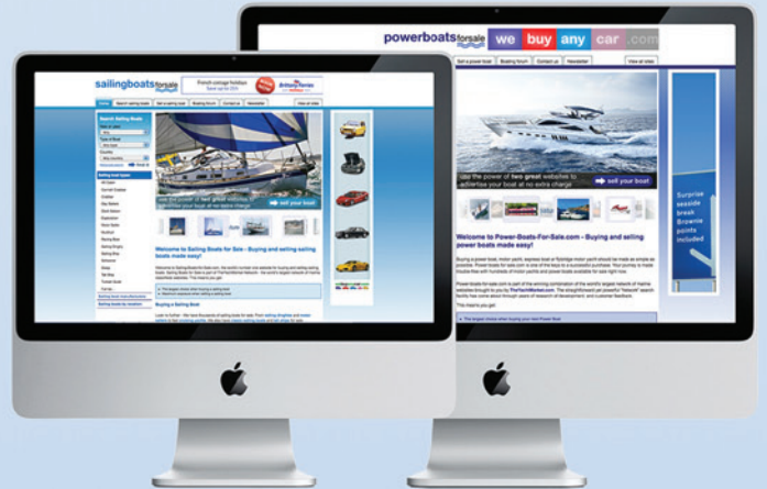
Sailing Boats for Sale www.sailing-boats-for-sale.com Power Boats for Sale www.power-boats-for-sale.com