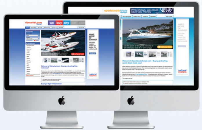
RIB Market www.ribmarket.com Sports Boats for Sale www.sportsboatsforsale.com